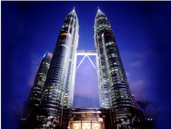
Diethelm Events Big Event Sale