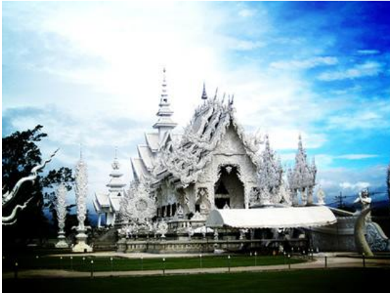
Diethelm Events Big Event Sale