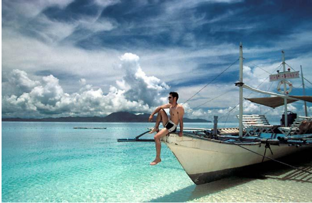
Diethelm Events Big Event Sale